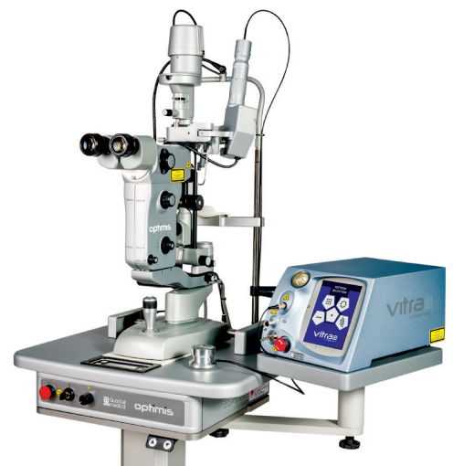
Combined glaucoma (SLT) & after cataract (YAG) laser made by Quantel Medical purchased by LEF Capital Campaign.

We are in the business of helping people, but it costs money. Our total LEF budget for FY 2016-2017 is $667,300. Program Services (patient related costs) accounts for 80% of our budgeted expenditures. Resource Development (which includes this newsletter) is only 16%. But, most importantly, Administrative expenses are a paltry 4%.... an amazingly wise and productive use of your hard-earned donations to the Foundation. As this point halfway through our fiscal year, we are running a deficit of $100,000. So if you are able, please consider making a donation to LEF.